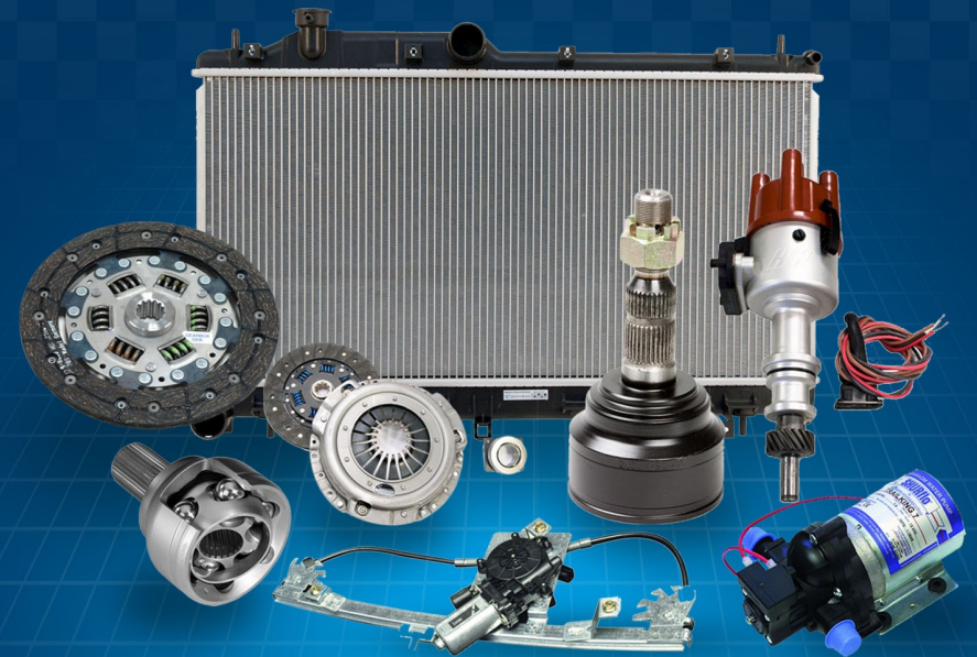
RADIATORS • CV JOINTS • SUSPENSION PARTS ELECTRIC WINDOW REGULATORS • WATER PUMPS • CLUTCHES • ELECTRONIC DISTRIBUTORS